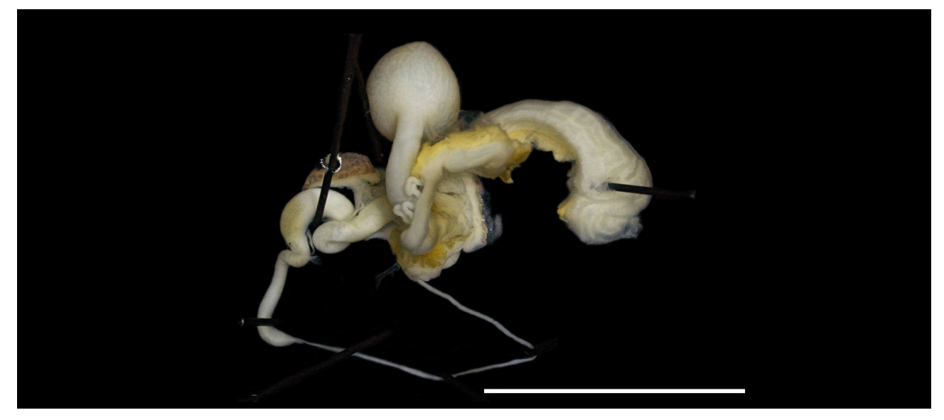
Fig. 3. Genital anatomy of Tandonia kusceri (H. Wagner, 1931). Scale bar 10 mm