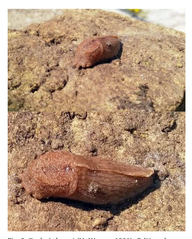
Fig. 2. Tandonia kusceri (H. Wagner, 1931). Palić settlement near Subotica.

T. kusceri can be confused with several other species such as Tandonia rustica (Millet, 1843) and T. serbica (H. Wagner, 1930). It differs from T. rustica in its less slender and darker body, and longer epiphallus and from T. serbica in its larger size, absence of black spots on the back and longer epiphallus (WIKTOR 1996). T. kusceri is often found sympatrically with T. serbica so that WIKTOR (1996) wondered if they